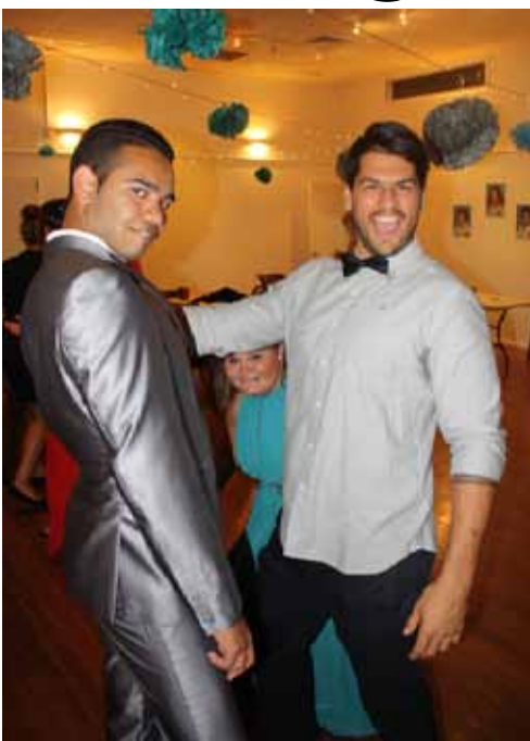
Looks like "hot shots" hit town a couple of weeks early