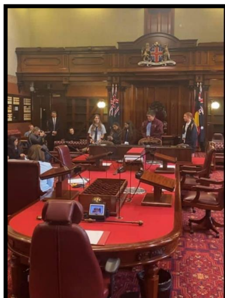
Acknowledgement to Country in Ngemba / Barkinji and English