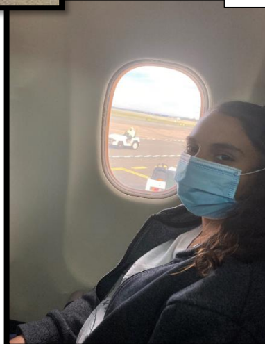
Heading for home.....